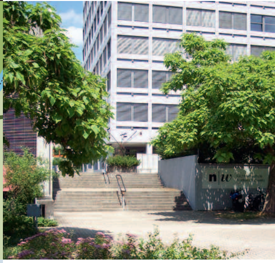
University of Applied Sciences North-western Switzerland FHNW